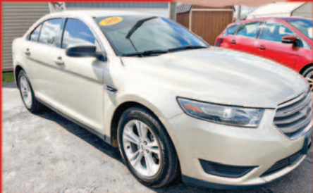
2018 FORD TAURUS Gold, 78,xxx Miles $16,750