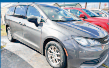
2020 CHRYSLER VOYAGER Gray, 129,xxx Miles $16,900