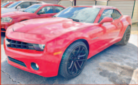
2013 CHEVROLET CAMARO Red, 151,xxx Miles $11,400