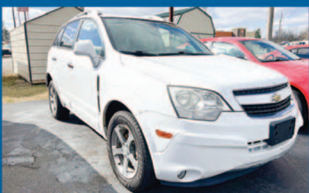
2014 CHEVROLET CAPTIVA White, 115,xxx Miles $9,985