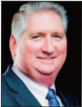
NEWCOM Crittenden Judge-Exec

Continued from page 1 have arisen about its completeness and viability during the review process. In light of that, local leaders have huddled back up and decided to retool the grant application with an “urgent need declaration” and ask for more money. Crittenden will be seeking $1.5 million and Crittenden $1.5 million in the current funding cycle for CDBG funding.