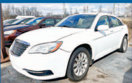
2014 CHRYSLER 200 White, 93,xxx Miles $10,500