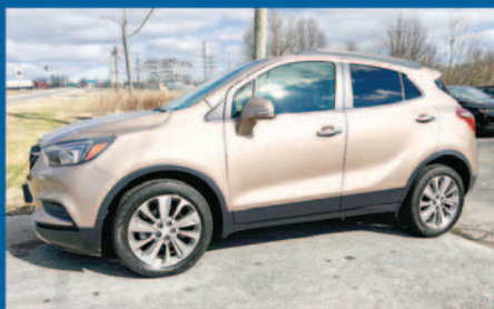
2019 BUICK ENCORE Bronze, 48,xxx Miles $19,995

LOW MONTHLY PAYMENTS! ON-THE-LOT FINANCING AVAILABLE!