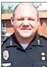
WEST Police Chief

"High school age kids might be swapping pills. That's not uncommon. They might think they're getting a mild painkiller pressed in a lab. They might think it's Oxycodone or Lortab, but it ends up being fentanyl," he said. "You don't have to be using a needle