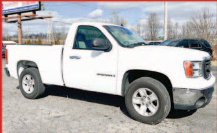
2007 GMC SIERRA White, 155,xxx Miles $10,495