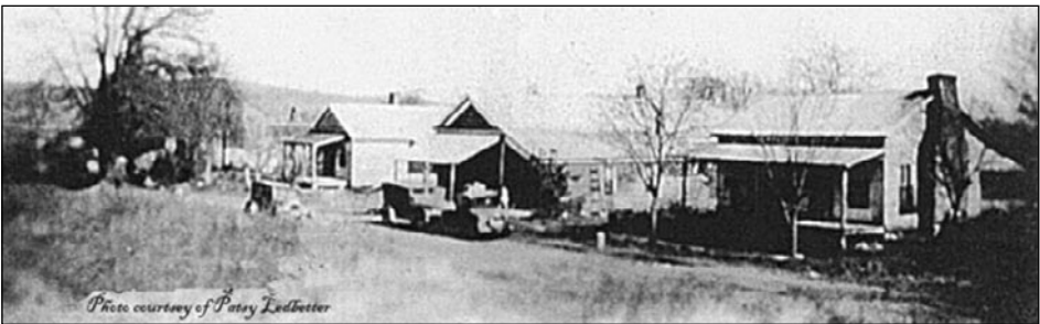
Pictured from right is a family dwelling, the middle building was the community store, post office and living quarters and the last building on the left was a millinery shop.

The influx of workers caused this sleepy village to wake up to supply housing for the many workers. Every available structure was turned into housing, and the popula-