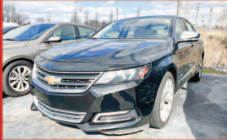
2017 CHEVROLET IMPALA Black, 124,xxx Miles $13,900